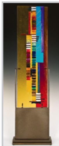
K4 Glass Art

Admission: Adults $8, children under 12 free. Group discounts available. For more information visit www.craftguild.org or call (828) 298-7928.